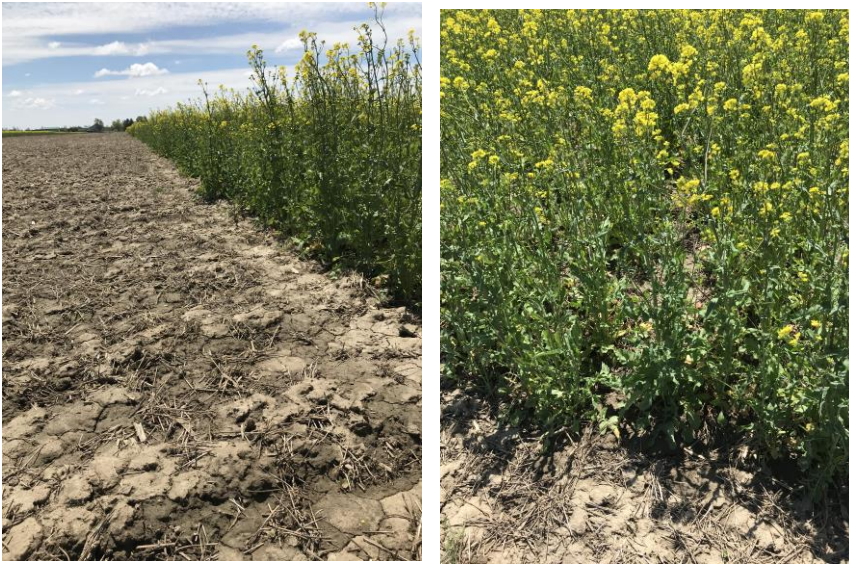
Image 3: Cover Crop Growth at Lucan 2018 (left) and Elmira 2019 (right)