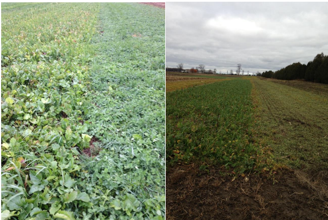
Image 1: Multi-Species Mix and Single Cut Clover (BMP) at Bornholm October 15 November 8

The corn results are shown in tables 3, 4, and 5. In 2018 spring cereal rye growth was variable with some winter kill occurring in lower areas of the field but overall winter survival was good. In 2019 very little rye overwintered while the tillage radish did, which was unexpected. Wet weather during the spring of 2019 delayed planting until June at both the Lucan and Bornholm locations. By the time the tillage radish was finally terminated it was already in full flower (image 2). Image 3 shows the amount and colour of the cover crop residue when the corn began to emerge in 2018 and 2019. In 2018 most of the greenness came from the terminated cereal rye while in 2019 most of the greenness came from vetch. Greenness ratings were taken on the same day as the corn first emerged (Image 3) and are shown in table 3. Greenness ratings were conducted using the Canopeo app, developed by the Soil Physics Research Group at Oklahoma State University. It gives an indication as to how much of the ground is covered by green plant material.